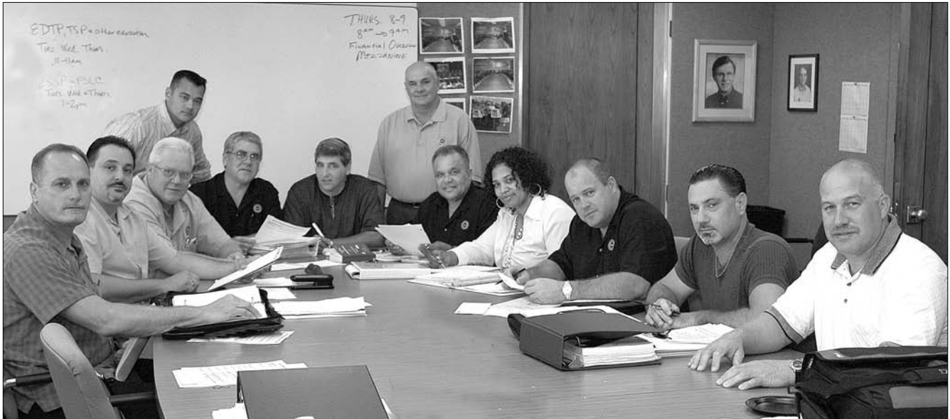
The 2007 UAW Ford National Negotiating Committee consists of local union members elected by their co-workers.