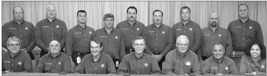
The 2007 UAW Ford National Negotiating Committee

Skilled trades gains 20 cents-an-hour tool allowance, $20 million tool and die investment in Dearborn, Mich.